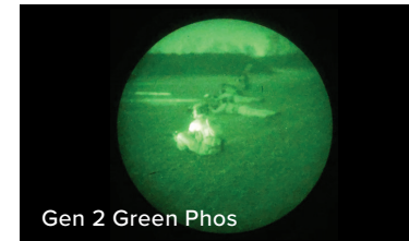
Gen 2 Green Phos