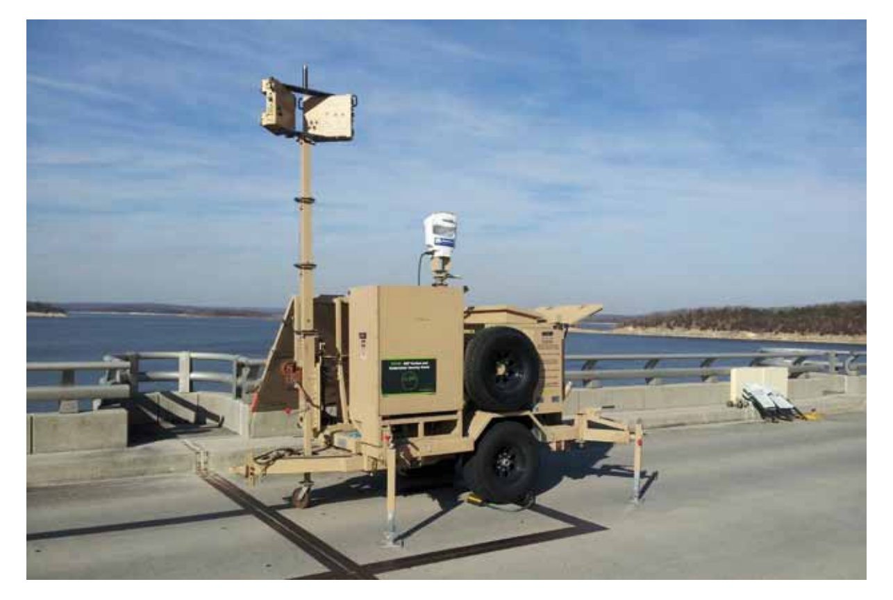
Figure 1 - Blighter coastal security radar mounted on trailer-based mobile surveillance platform (Deployed at the Truman Dam, MO, USA)

The Blighter radar's PESA (Passive Electronic Scanning Array), Doppler and FMCW (Frequency Modulated Continuous Wave) technology offers zero maintenance, ultra high reliability, low power consumption, covertness and an ability to detect and locate small covert boats in the complex coastline region. Additionally it can provide conventional long range boat and ship tracking functions integrated with AIS (Automatic Identification System).