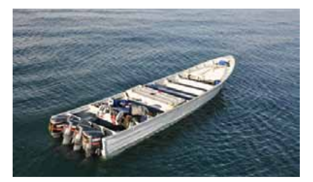
Figure 2 - Typical 'Panga' or 'Dory' style fishing boat

In some regions, where an individual person is involved, such as an asylum seeker or smuggler, it is possible for that person to swim ashore, possibly from a nearby island or perhaps a neighbouring country. Generally any person