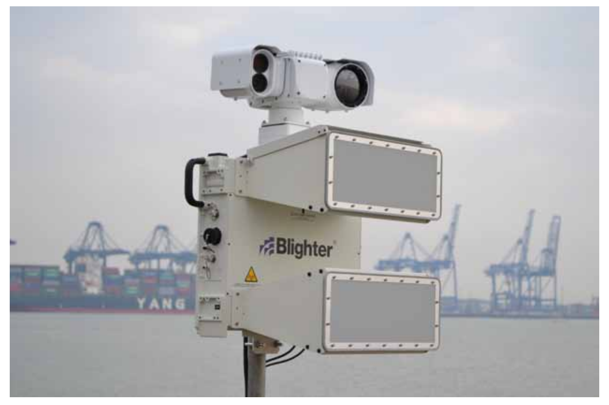
Figure 6 - Blighter radar with integrated camera system (Port of Felixstowe, UK)

of functionality to provide automatic, semiautomatic and manually initiated cueing of the camera system to observe the target or targets of interest. Typical 'cameras' include multi-sensor electro-optic camera systems including daylight colour, night time thermal imager, often a wide field-of-view 'context' camera and sometimes a Laser Range Finder (LRF), though this is less necessary with radar providing accurate range measurement. Each alert zone can be configured to cue a selected camera either to a fixed point in the zone, the target position in that zone, or to initiate auto-tracking. Some camera systems include a video tracking capability, which BlighterView HMI supports.