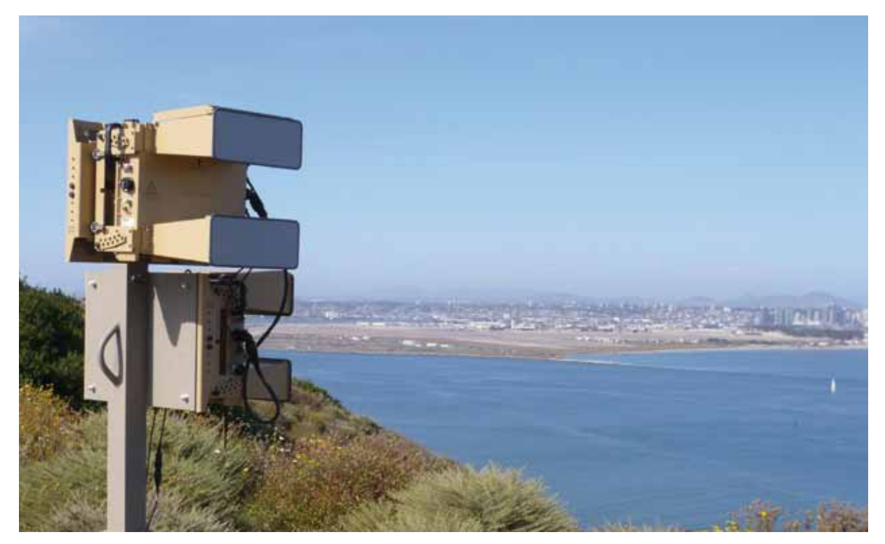
Figure 4 - Blighter C400 series coastal security radar (Point Loma, San Diego, CA, USA)

Blighter's PESA e-scan modules use a unique waveguide structure to achieve the azimuth beam steering. Unlike traditional AESA (Active Electronic Scanning Array) antennas, which use multiple power-hungry power and phase control elements, Blighter's unique PESA units require just one efficient transmitter and one receiver unit per radar unit. Due to this compact and simple architecture, Blighter uses e-scan modules on both the transmit and receiver paths resulting in exceptionally low sidelobe levels, which allows the radar to operate in complex environments such as dockyards and harbours