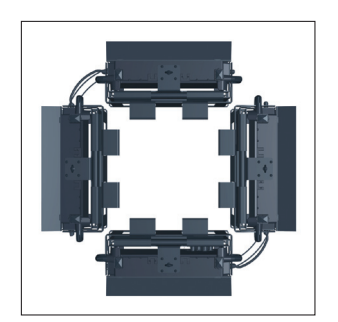
Blighter Dual A422 Radars - 360° 2x Main Radar Unit 2x Auxiliary Radar Unit