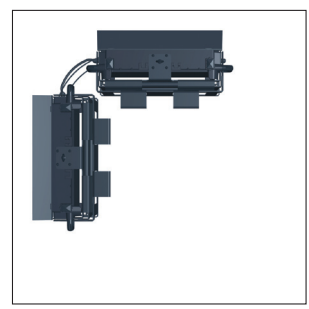
Blighter A422 Radar - 180° 1x Main Radar Unit 1x Auxiliary Radar Unit