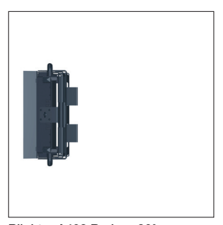
Blighter A402 Radar - 90° 1x Main Radar Unit